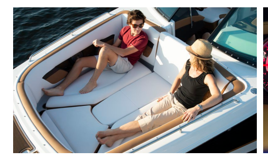
BOW FILL-IN CUSHIONS

Much needed comfort and privacy comes easy when you have bow fill-in cushions at your disposal.